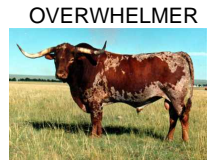
SHE'S A SUPER LADY